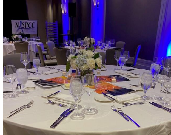
Saturday November 5, 2022 Scientific Education Sessions Wrap-up for Awards