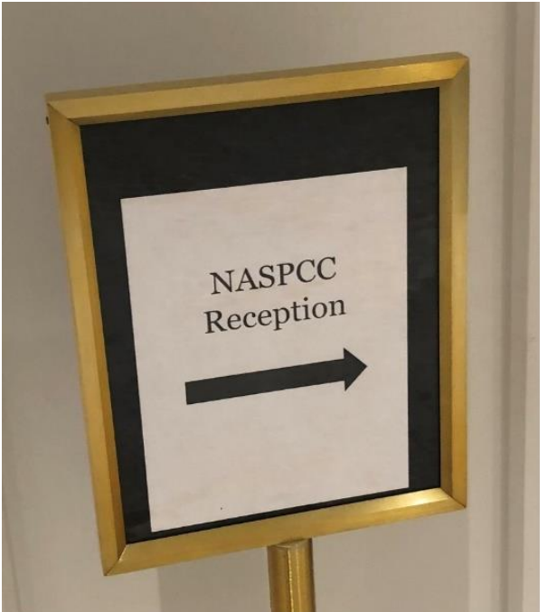
Friday November 4, 2022 17 th Annual Meeting Reception: Fairmont Hotel, Washington, DC