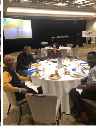
Saturday November 5, 2022 Faculty and Attendees Ready for Scientific Education Sessions