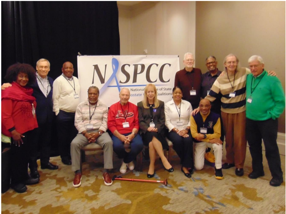
Sunday November 6, 2022 !7 th Annual Meeting Ends, Getting Ready For the 18 th Annual Meeting October 2023